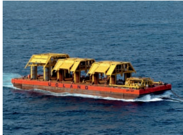
A Snøhvit template on its way to Hammerfest.

LNG is primarily shipped from Melkøya to customers in the USA, as well as to Spain and France. Liquefied petroleum gases (LPG) and condensate are sent by sea to other markets. Every fifth or sixth day, one of the world's largest LNG carriers will load at the plant. That adds up to about 70 shipments per year. Each of the five dedicated LNG carriers is 290 metres long and can carry some 140 000 cubic