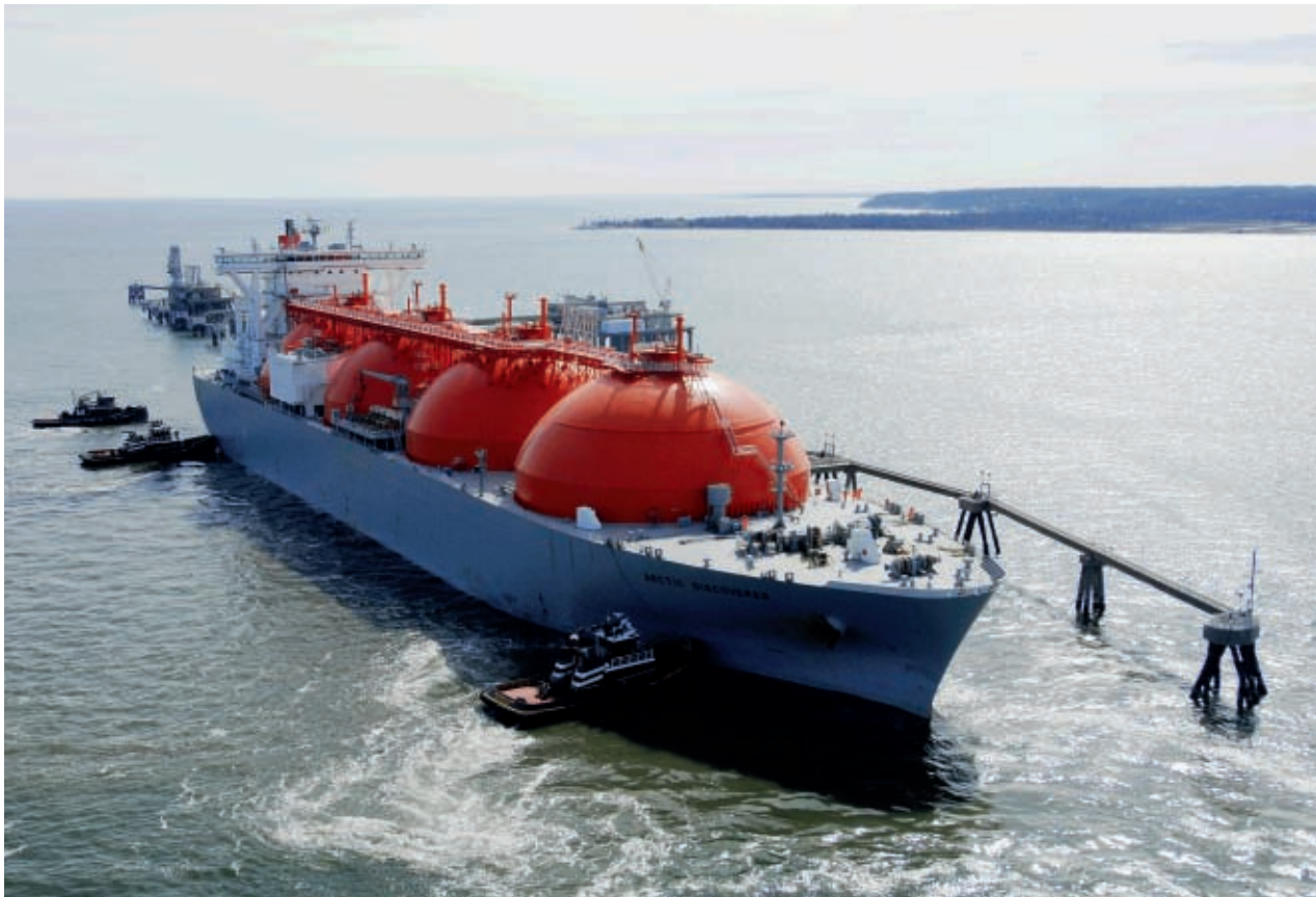
Arctic Voyager discharging at Cove Point in the USA.

metres. Operator Statoil and five of the other Snøhvit licensees have chartered three vessels – Arctic Princess, Arctic Voyager and Arctic Discoverer – from Norway's Leif Høegh & Co and Mitsui OSK Lines of Japan. French licensees GDF Suez E&P Norge and Total handle their own share production with a carrier each – Provalys and Arctic Lady respectively.