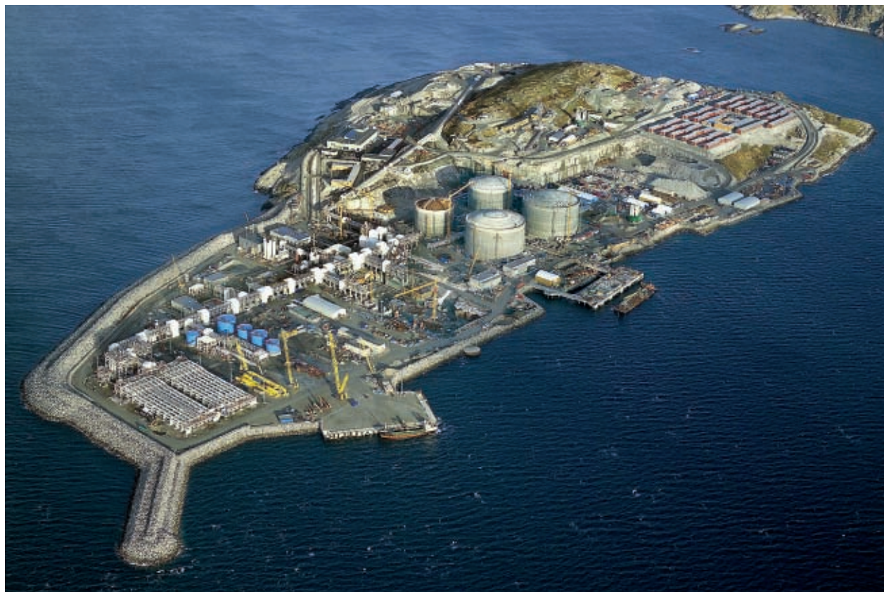
Melkøya outside Hammerfest.